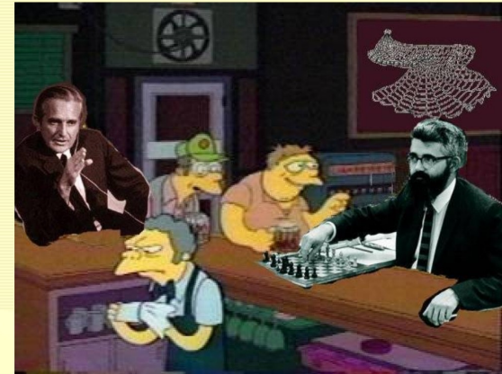
Caption: John McCarthy having a dialog with Doug Engelbart at a tavern ... with 'the fishnet' on the wall